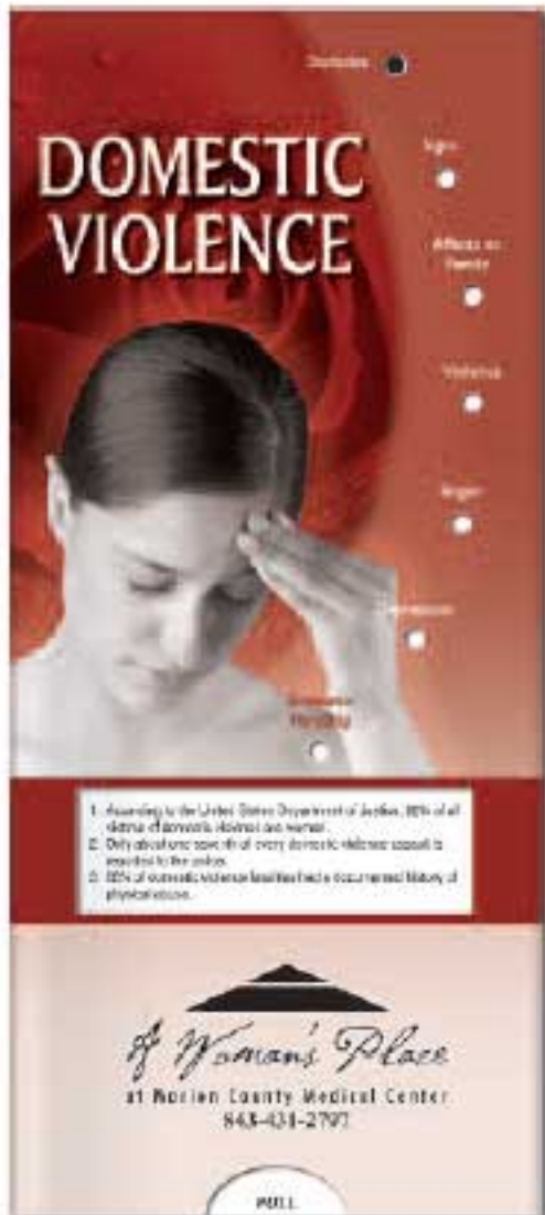
#2051 Pocket Slider Interactive slide chart

Domestic Violence - Understand and learn about this growing issue of abuse against women and children.