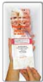
#2059 Pocket Slider Interactive slide chart

Mix & match Multiples of 100 pieces per title