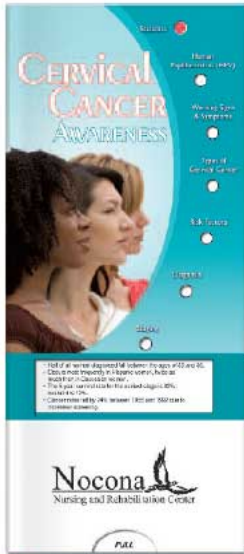
#2068 Pocket Slider Interactive slide chart

Set Up: $35(G). Product Size: 3-3/4" x 8-1/2". Imprint: 2-1/4" x 1-1/8". Production: 10 days. See imprint colors on page 62.