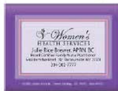
Back cover imprint