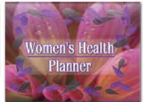
#4503 Planner 24-page full color

Women's Health - Everything you need to keep track of your important medical information, insurance ID cards and medication records.