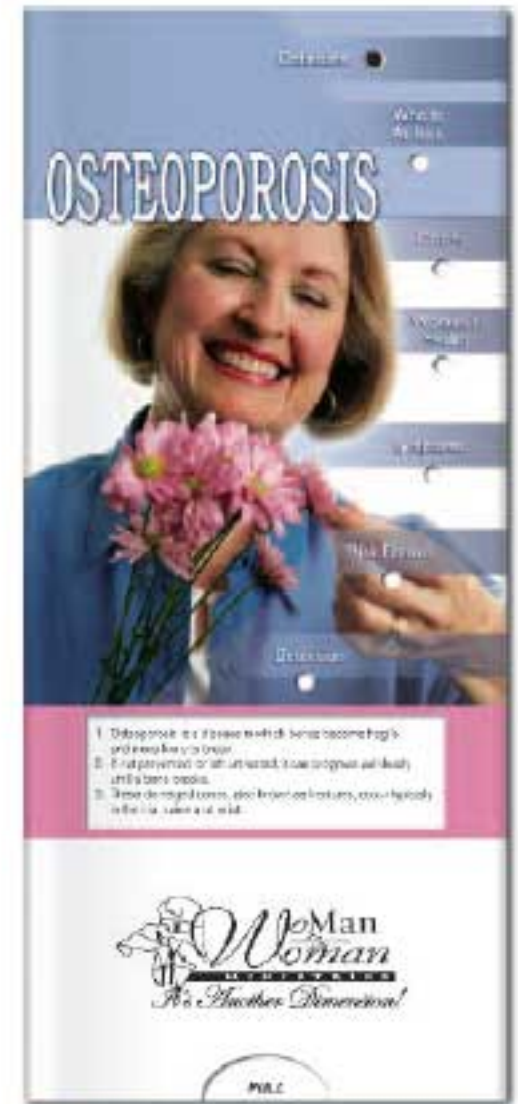
#2047 Pocket Slider Interactive slide chart

Set Up: $35(G). Product Size: 3-3/4" x 8-1/2". Imprint: 2-1/4" x 1-1/8". Production: 10 days. See imprint colors on page 62.