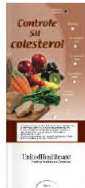
Controlling Your Cholesterol #2105s (see page 23)