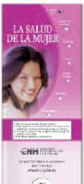
Women's Health #2026s (see page 12)