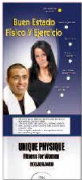
Fitness and Exercise #2012s (see page 49)