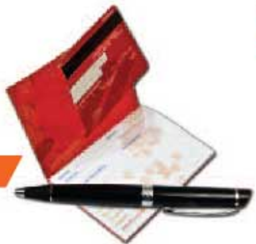
Med-Tracker Record Keeper #4501s (see page 10)

Set Up: $35(G). Product Size: 3-7/16" x 2-1/2" Imprint: 2-1/16" x 1-1/8". Production: 10 days. See imprint colors on page 62.