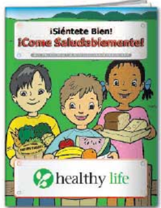
Eat Healthy #CB1005s (see page CB5)

Set Up: $35(G). Product Size: 2-1/8" x 3-3/8" Imprint: 2-1/2" x 1-3/8". Production: 10 days. Key Points ship flat. See imprint colors on page 62.