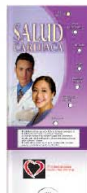
Healthy Heart #2015s (see page 22)