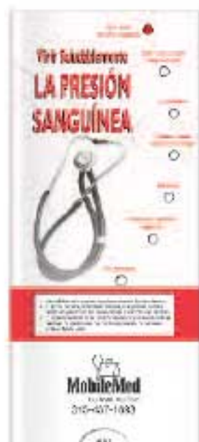
Blood Pressure #2041s (see page 21)