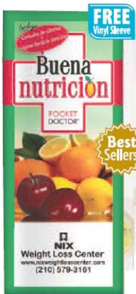
Good Nutrition #3007s (see page 44)