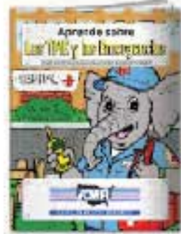
EMTs and Emergencies #CB1141s (see page CB6)