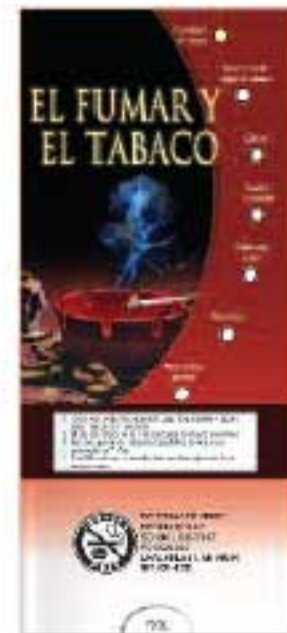
Smoking & Tobacco #2122s (see page 47)