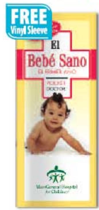
Healthy Baby #3003s (see page 15)