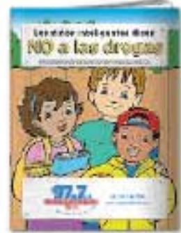
NO to Drugs #CB1007s (see page CB5)