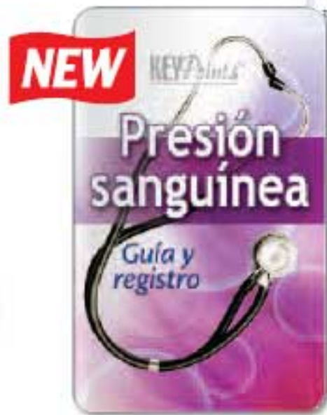
Blood Pressure Key Point #7005s (see page 20)