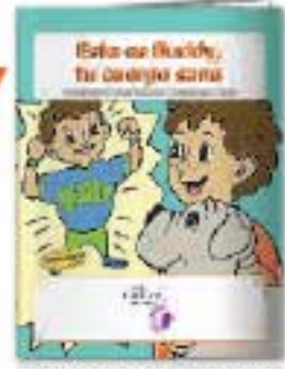
Healthy Body #CB1044s (see page CB5)

Set Up: $35(G). Product Size: 8" x 10-1/2" Imprint: 5" x 1-1/2". Production: 10 days. See imprint colors on page 62.