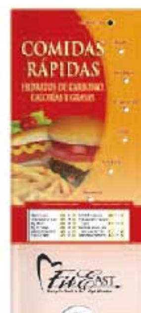
Fast Foods #2032s (see page 45)