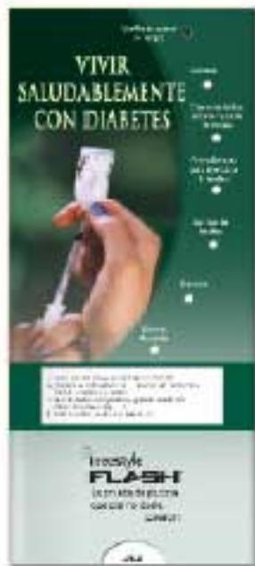
Staying Healthy with Diabetes #2017s (see page 24)