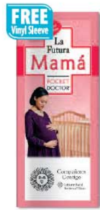
Expecting Mom #3004s (see page 15)