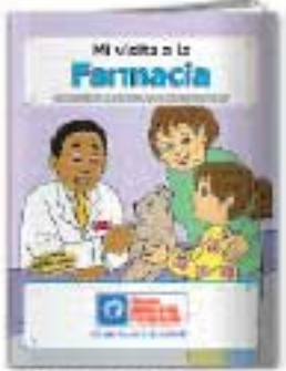
Visit to the Pharmacy #CB1003s (see page CB4)