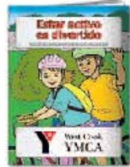
Fitness is Fun #CB1008s (see page CB6)