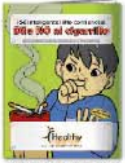
NO Smoking #CB1016s (see page CB5)