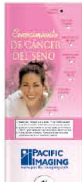
Breast Cancer Awareness #2002s (see page 11)