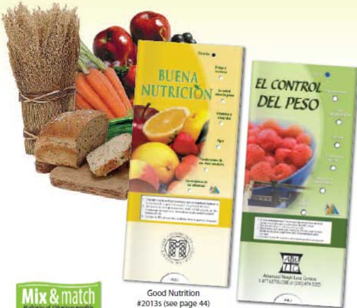
Good Nutrition #2013s (see page 44)