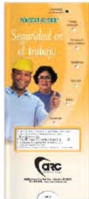
Workplace Safety #2027s (see page 37)