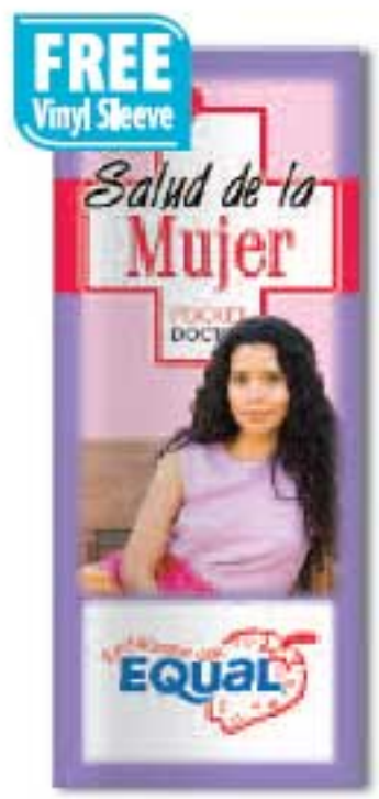
Women's Health #3005s (see page 12)