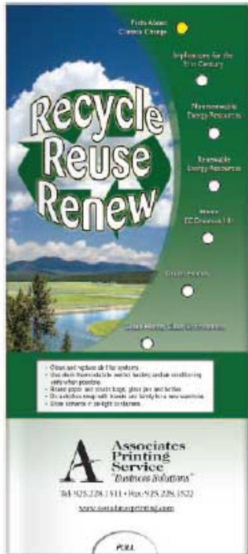
#2063 Pocket Slider Interactive slide chart

Recycle, Reuse, Renew - It's easy to be green when you learn some handy hints for recycling. Facts about global warming, and easy ways to save energy and money at home, in the car and more.