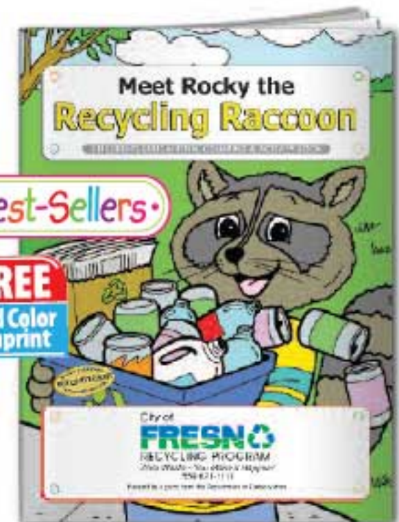
#CB1065 Coloring Book 16-pages with complete storyline

Meet Rocky the Recycling Raccoon - Rocky teaches us that Recycling is really important for all of the people and all of the animals on the planet!