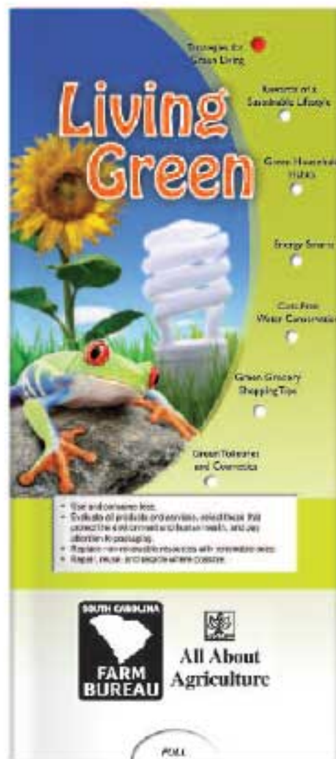
#2071 Pocket Slider Interactive slide chart

Living Green - Going Green is easy with this helpful slide chart. Provides tips on how to reuse and recycle, raise "Green" kids and go paperless. Also includes transportation alternatives, basic principles of green cleaning and Green grocery shopping tips.