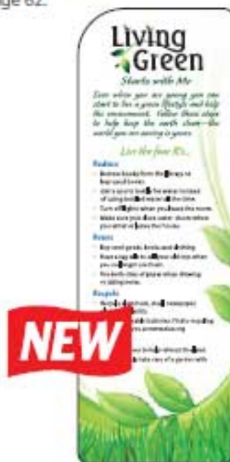
#BM8023 Bookmark Informative bookmark

Living Green Starts with Me - We all have an effect on the environment. This bookmark offers suggestions on how we all can do our part.