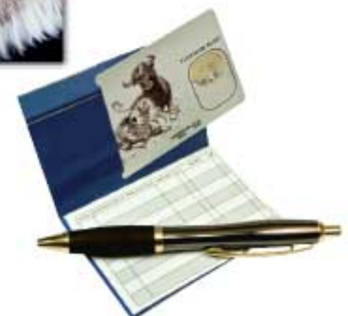
#4051 Patriotic ATM/Debit Card Pocket Register 16-page register

Never forget another transaction! Sixteen register pages to keep track of all your ATM & Debit Card activity.