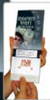
#2034 Pocket Slider Interactive slide chart

Identity Theft - Avoid being a victim and learn some easy steps on how to avoid having your identity stolen and what you can do if it happens to you.