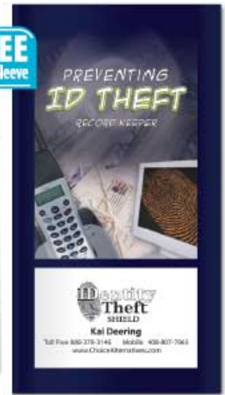
#3701 Mini Pro 12-page accordion fold with clear vinyl sleeve

ID Theft - Discover the different types of identity theft, warning signs and how to prevent it.