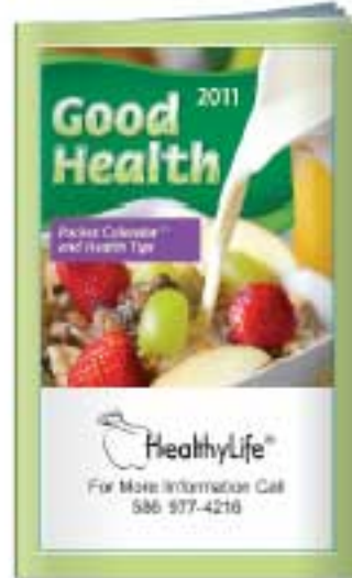
Also see page 23 for the 2011 Pocket Calendar & Health Tips

Set Up: $35(G). Product Size: 3" x 5-3/4" Imprint: 2-1/4" x 1-1/8". Production: 10 days. See imprint colors on page 62.