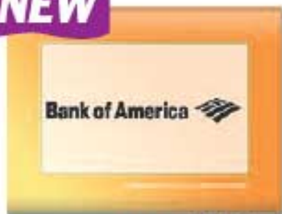
#4027 Fruit Basket