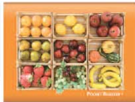
ATM/Debit Card Pocket Register 24-page financial info & register

Eight pages of info on protecting your identity, safeguarding your personal info, and saving your money and 16 register pages to keep track of all your ATM & Debit Card activity. Never forget another transaction!