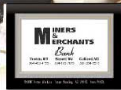
#4021 Black Sphere

250 500 1,000 2,500 5,000 5C $1.09 1.02 .98 .92 .84 5C Set Up: $35(G). Product Size: 3-7/16" x 2-1/2" Imprint: 2-1/16" x 1-1/8". Production: 10 days. See imprint colors on page 62.