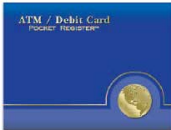
ATM/Debit Card Pocket Register 16-page register

Never forget another transaction – 16 register pages to keep track of all your ATM & Debit Card transactions.