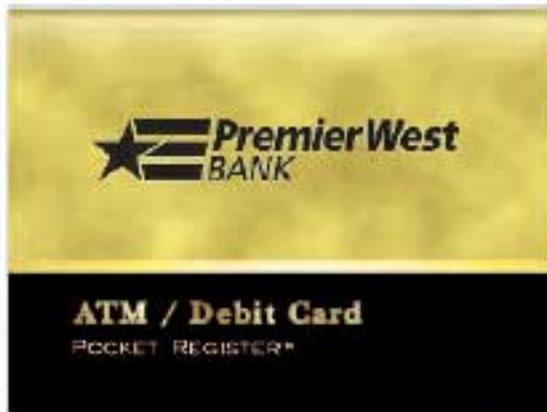
ATM/Debit Card Pocket Register 16-page register

Never forget another transaction – 16 register pages to keep track of all your ATM & Debit Card transactions.